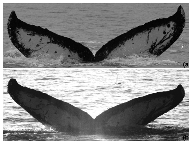
Fig. 2. (a) Individual humpback whale (PH013/SPLASH ID 440014) seen in the Babuyan Islands, Philippines breeding ground in the winters of 2002 and 2004. (b) Same individual humpback whale (#598) seen in the Commander Islands, Russia feeding ground in the summer of 2010.